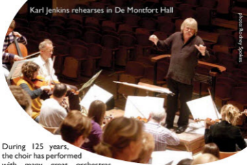
Karl Jenkins rehearses in De Montfort Hall