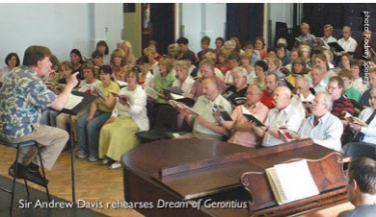
Sir Andrew Davis rehearses Dream of Gerontius